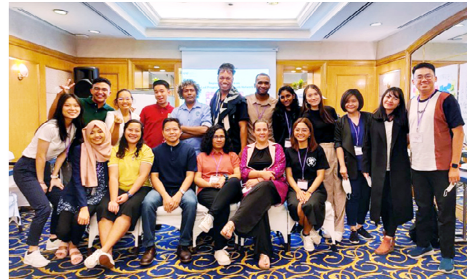
青年義工赴馬尼拉參與青年義工培訓 Youth volunteer participated in youth volunteer training in Manila

The General Assembly was successfully held in Bogotá, Columbia on 21-25 November 2022 on a hybrid mode with the Association participation via zoom. Our Association had undergone an IPPF's accreditation in November 2021, meeting the essential membership of 48 standards and passing the re-accreditation, and was appraised as a well-managed, transparent, responsible leading organization striving for quality assurance in sexual and reproductive health and rights. The Association would continue to constantly review and follow up on the accreditation team's recommendation.