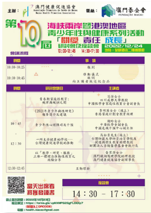
第十屆海峽兩岸暨港澳地區青少年性與健康系列活動「關愛、責任、成長」網絡研討會 The 10th Cross–Strait, Hong Kong and Macau Seminar on Adolescent Sexuality and Health