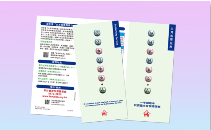
生育指導服務單張 Subfertility Service pamphlet

Subfertile couples are offered clinical assessment, treatment and referral to specialists for further management if required. Our Artificial Insemination by Husband (AIH) service treats couples with subfertility due to mild male factors or unexplained causes. 975 clients were served in 2022.