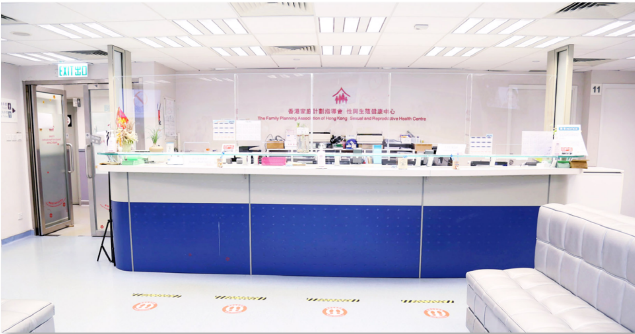
灣仔性與生殖健康中心 Wan Chai Sexual and Reproductive Health Centre

定期子宮頸篩查能測出早期子宮頸的異常變化，及早診治能預防演變成子宮頸癌。家計會委託香港大學病理學系提供子宮頸細胞化驗服務。目前，本會是本港提供子宮頸篩查服務的主要機構之一，2022 年處理的子宮頸細胞檢驗總數為 31,954。