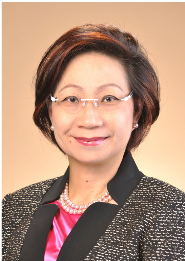
榮譽會長梁唐青儀女士 Mrs Regina Leung, Honorary President